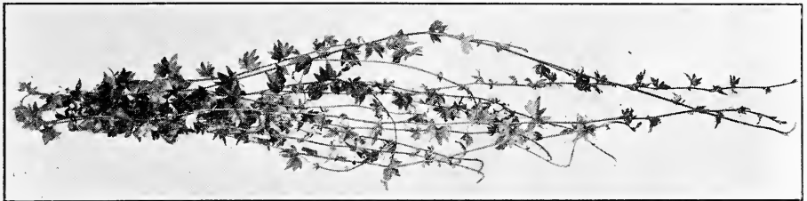
AMPELOPSIS INCONSTANS LOWII